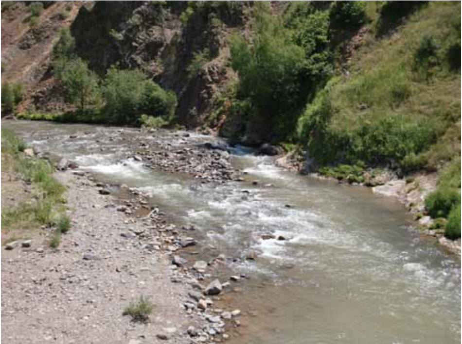
Fig. 6. Limnophora mediterranea Pont, sp. n., a typical habitat on gravel and pebbles by the River Arpa at Jermuk, Armenia, 39°50'N 45°41'E.