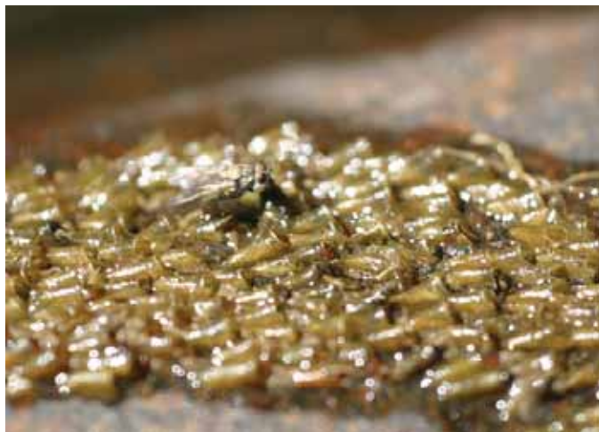
Fig. 11. Limnophora sp., ♀, probably L. pandellei Séguéy, feeding on pupae of Simulium variegatum Meigen, on the pipe running along a tributary of the River Argichi at Nerkin Getashen, Armenia, 40°09'N, 45°16'E.