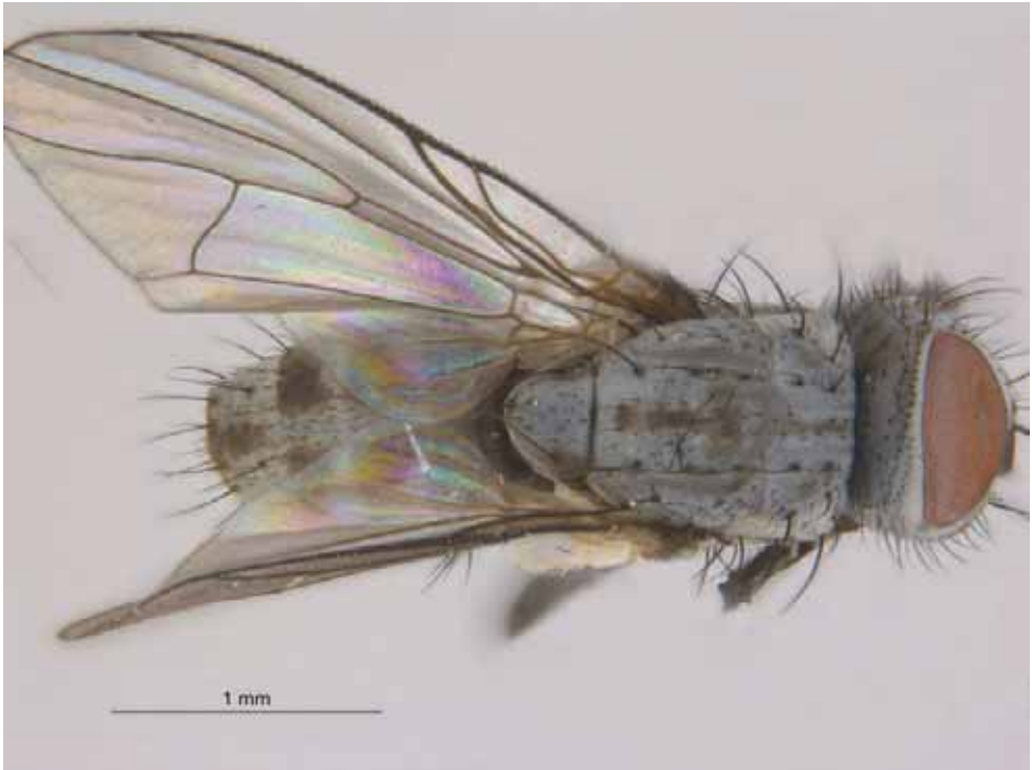
Fig. 5. Limmophora mediterranea Pont, sp. n., holotype ♂.

partially or wholly confluent just behind suture and forming a band that extends transversely between the intraalar rows; sternite 5 as in Fig. 1; terminalia as in Figs 2–3. ♀: scutum light grey with three brown vittae running through the acrostichal and dorsocentral lines, the area between them sometimes partly to wholly darkened just behind suture ..... mediterranea Pont, sp. n.