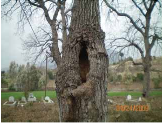
Fig. 2. One of the old oaks studied near Kozan in southern Turkey.

Sampling methods. The beetles were collected with window traps. The window traps used consisted of a 30x60 cm wide transparent plastic plate with a tray underneath (JANSSON & LUNDBERG 2000). They were placed near the trunk (<1 m), beside or in front of a cavity entrance. Their positions were 2.0-3.0 m from the ground, depending on where the cavity entrance was situated on the studied tree. The traps were partially (about ½ of the volume) filled with ethylene glycol and water (50:50 v/v), with some detergent added to reduce surface tension. The traps were placed in the trees at the end of April, were emptied every third week, and were eventually removed in the middle of August. As the sampling did not cover the entire flight periods for all species, some early and late species may not be represented in the material. The material is deposited in the Biology Department of Mustafa Kemal University.