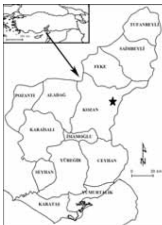
Fig. 1. The position of the studied site in southern Turkey.

Although the Mediterranean region is considered to be a biodiversity hotspot (MEDAIL & QUEZEL 1999, MYERS et al. 2000), only a few systematic studies report on the biodiversity of beetles in Mediterranean tree habitats (e.g. BRIN & BRUSTEL 2006, BUSE et al. 2008, JANSSON & COŞKUN 2008, DA SILVA et al. 2009). Only recently have studies of old oaks ( Quercus spp.) in Turkey reported a rich fauna, with many new species to science (SCHILLHAMMER et al. 2007, NOVAK et al. 2011, PLATIA et al. 2011, SAMA et al. 2011). Our study aimed to increase the knowledge of the beetle fauna on old oaks in Turkey and to discuss the value of this kind of habitat for the fauna.