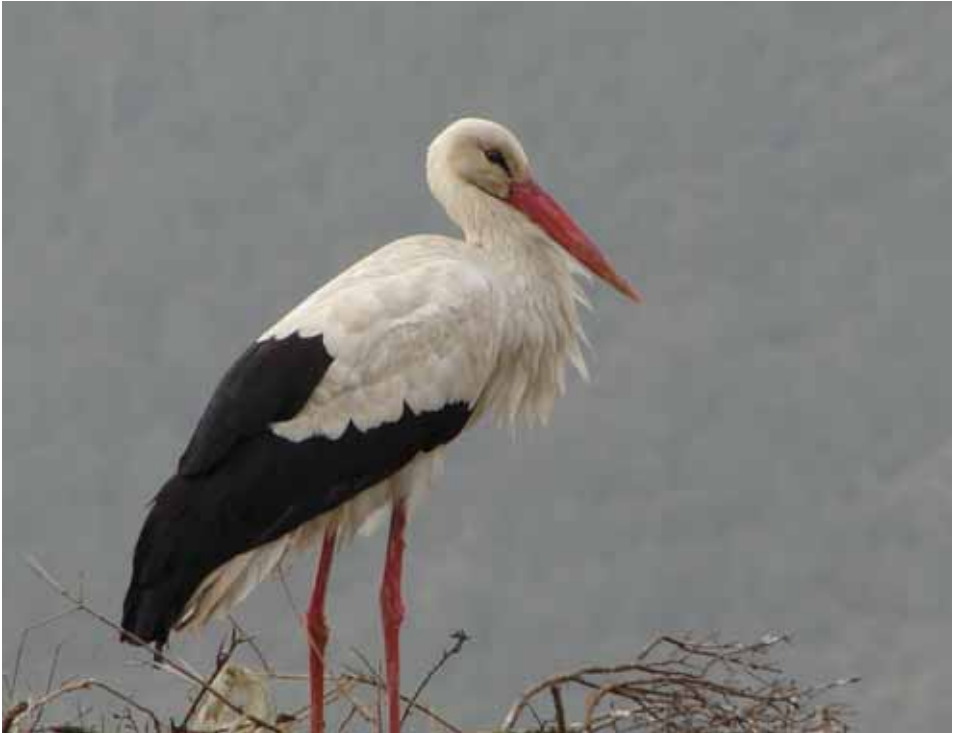
Fig. 2. White Stork, Ciconia ciconia .

Meteorological Works). Nestlings will thus avoid hypothermia during extensive rain and cold temperatures, which will increase the breeding success.