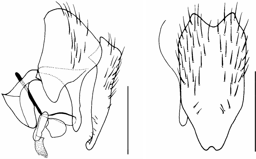
Figs. 2–3. Coenosia wernerae n. sp. (paratype). 2 (left). Hypopygium, lateral view; 3 (right). Cercal plate. Scale: 0.5 mm.

anteroventrals in apical half; in ♀ with several posteroventrals in basal half, and a loose row of setae along anteroventral surface; 1 dorsal but 0 posterodorsal preapical. Hind tibia with 1 anterodorsal, 1 anteroventral and 1 posterodorsal seta; dorsal preapical strong, anterodorsal apical short, the dorsal placed above the anterodorsal by a distance equal to basal width of tibia.