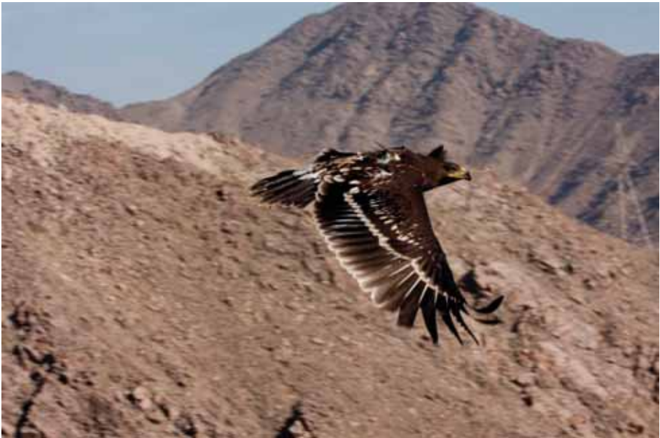
Fig. 2. Greater Spotted Eagle Aquila clanga with solar-powered satellite transmitter.